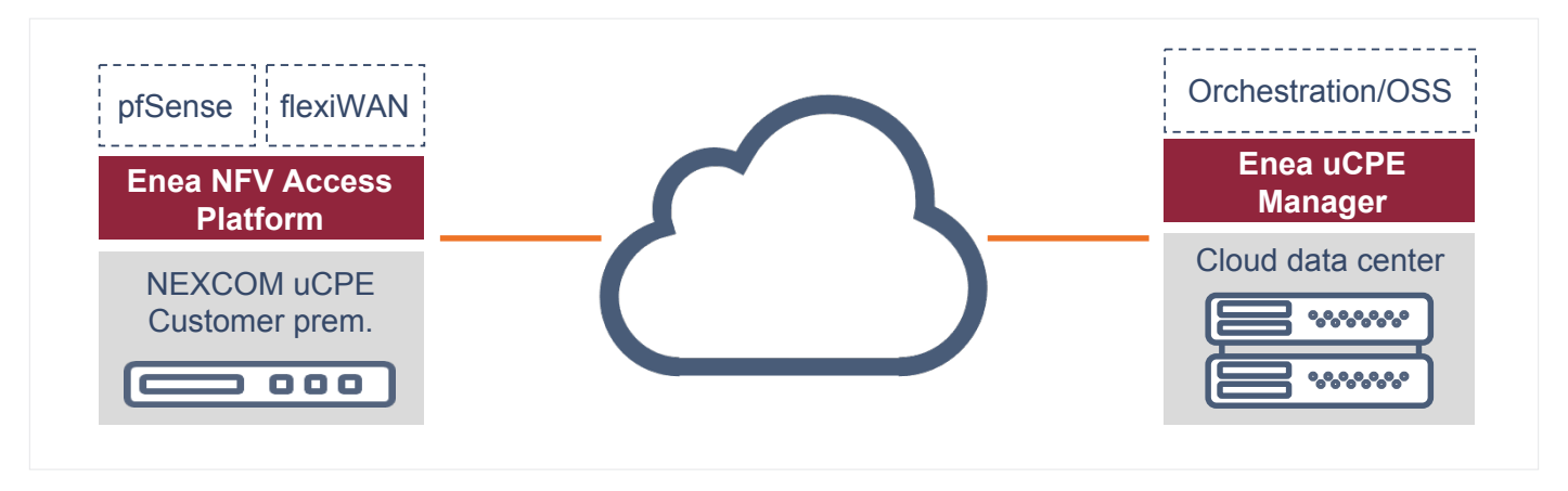
Figure 3. Block diagram of demonstration setup including Enea NFV Access Platform as the provider of all network functions virtualization infrastructure (NFVI)