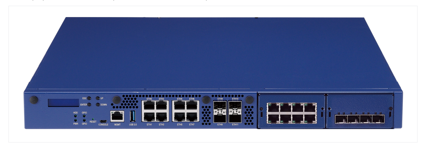
Figure 1. NEXCOM TCA 5170B

The server is a verified Intel® Select Solution for uCPE, which means it is optimized for uCPE applications.