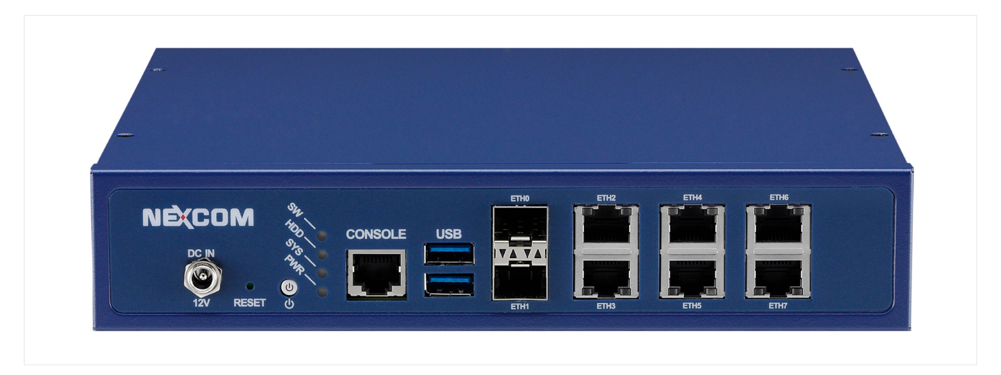
Figure 2. NEXCOM DTA 1160

This desktop uCPE supports up to 64 GB of DDR4-2400 RAM and has two 10 GbE SFP+ ports and six 1 G RJ45 ports. For storage, the uCPE supports a 2.5" internal SSD that is optional, one SAA connector, or one M.2 SSD socket supporting either SATA or NVMe drives.