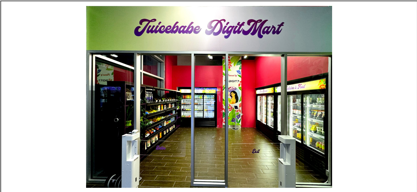
Figure 1. View of JuiceBabe DigitMart. Customers scan their payment cards on the entrance gate to the left and the system notes what items they select as they shop.