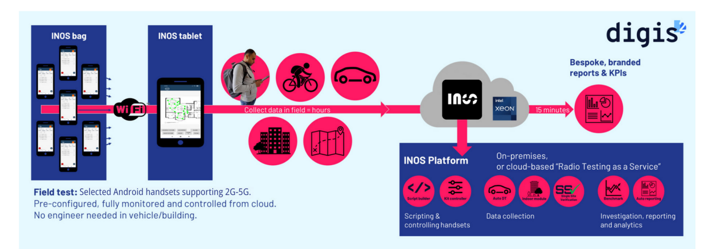
Figure 1. Drive testing process using INOS AI-based software.

Digis Squared is an Intel® Network Builders Gold Tier ecosystem member, and a leading provider of drive/walk testing tools, solutions, and services to MNOs worldwide. The company is at the forefront of using AI to simplify the drive/ walk testing process.