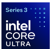
Intel® Core™ Ultra Series 3 Processors