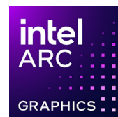
Intel® Arc™ B-Series Graphics