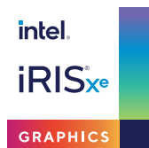
Intel® Iris® Xe Graphics