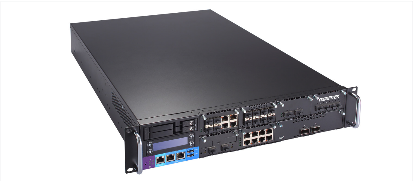
Figure 1. Front view of NA870 showing eight slots for LAN adapters.

Intel® Network Builders ecosystem partner Axiomtek has developed the NA870 network server that leverages the 3rd generation Intel Xeon Scalable processor family and 100 GbE Intel Ethernet Network Adapters E810-CAM2 for high performance compute and networking.