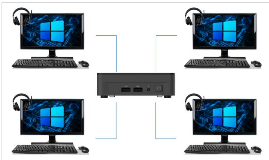
Figure 1: Intel® Hybrid Edge Computing Configuration

TSSC IT-INSIGHT Cloud Management Platform delivers remote administration capabilities purpose-built for schools without IT departments. TSSC's infrastructure monitoring platform, developed specifically for virtual lab deployments, connects directly to each NUC host through network integration. The platform monitors the base operating system running on each NUC that virtualizes the Windows or Linux environments for students, providing real-time visibility into system health and performance. School administrators access a centralized cloud-based dashboard that translates technical complexity into simple operational status. TSSC's support team handles remote golden image restoration, software updates, configuration management, and troubleshooting.